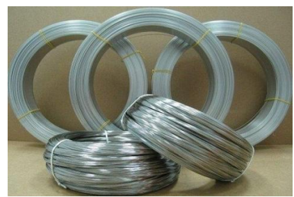
"Aesteiron House", 107, Kika Street, 4th Floor, Gulalwadi, Mumbai - 400 004, India.