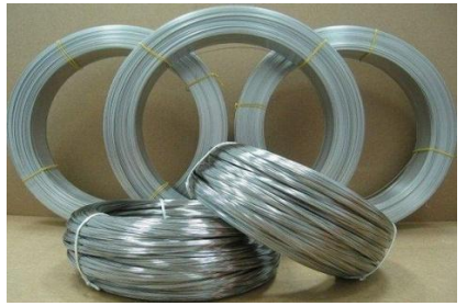
"Aesteiron House", 107, Kika Street, 4th Floor, Gulalwadi, Mumbai - 400 004, India.