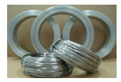
"Aesteiron House", 107, Kika Street, 4th Floor, Gulalwadi, Mumbai - 400 004, India.